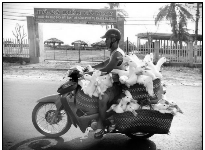
Duc Tran Spor