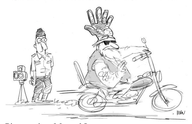
(Translation: Obligatory Gloves for Bikers)