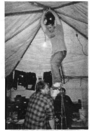
Cirque du MRA