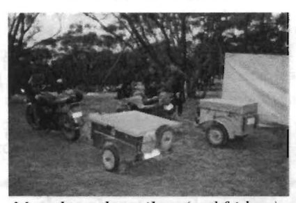
Many brought trailers (and fridges)