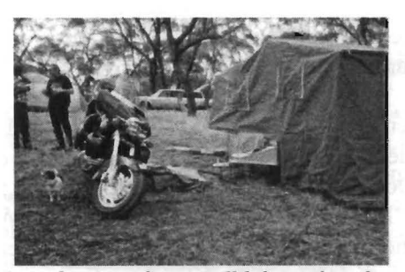
Huge dog guarding small bike and trailer