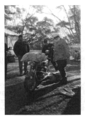
Meataxe and chopper