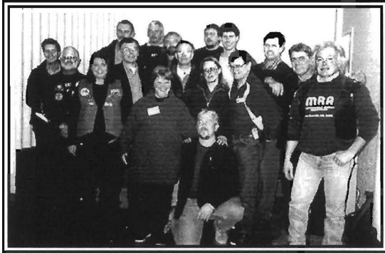
AMC CONFERENCE LAUNCESTON 12/7/2003

A total of 22 people attended the AMC Conference at Launceston on July 12. The group consisted of delegates from MRA Tas, MRA ACT, MRA SA, MRA WA, Ulysses, Tasmanian Motorcycle Council and NSW Motorcycle Council, Executive Committee members, AMC representatives and local observers.