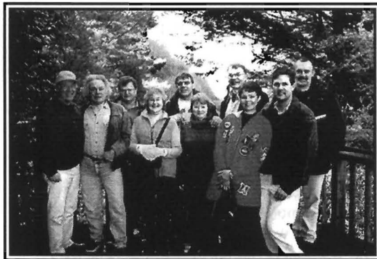
AMC CONFERENCE LAUNCESTON 12/7/2003

ATVs. Some individuals or bodies are suggesting ATVs should have rollover cages and that riders wear helmets. Although the industry supports the use of approved helmets in racing and recreational use, it doesn't support the suggestions in any other context. Farmers and graziers won't use a helmet when they're working on their property, cages would make the vehicles more susceptible to rollovers by raising the centre of gravity and would most likely dictate higher seats and seatbelts, and making the vehicles lower and wider would reduce their usefulness. Cages could not be retro-fitted to Australia's 200,000 vehicles.