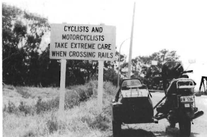
THANK YOU RENMARK COUNCIL