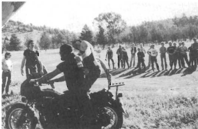
WEST COAST MEMBERS AT WORLDS END

If you're selling your bike, get some positive I.D. before letting it out for a test ride, such as a licence or credit card, and keep it until they return. Many bikes are stolen by bogus buyers.