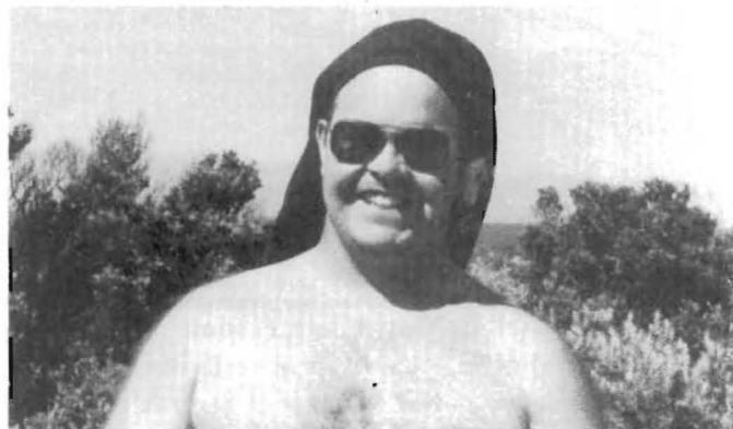
IS THIS A NEW FORM OF HELMET?