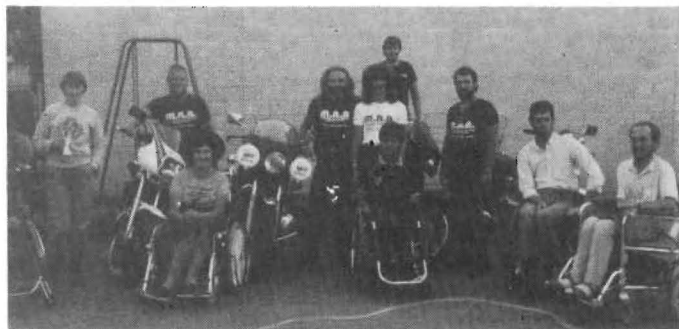
4 - CENTRE STAND MARCH '86