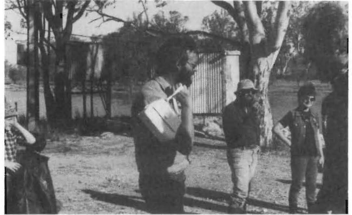
WHO SAYS MRA RIDERS ARE POOFS?