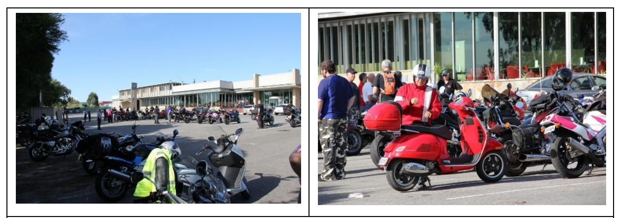
Just some of the scooters and bike in the Victoria Hotel car park Below is the view from Frank's rear mounted camera

The weather was brilliant and the ride group comprised 9 scooters (one with pillion) and one bike, as we started our journey. Some other scoots braved the SAMRATS journey.