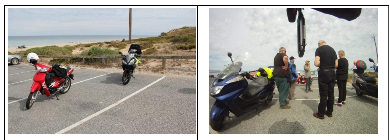
The calming views by the sea side at Aldinga Beach Below – Frank leading the pack up Willunga Hill

At Aldinga Beach we had a short break and conducted our commemoration to fallen riders. The sea views provided calm for a solemn occasion.