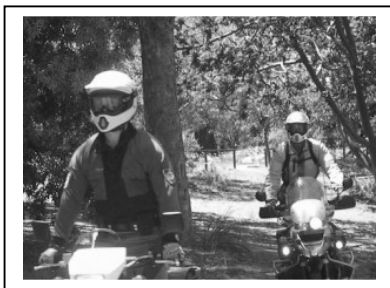
NSW Police training

"Bumpy roads and potholes: On rough roads, keep your speed down. That does three things – it gives you time to avoid the worst bumps or holes, reduces road shocks and gives your bike's suspension time to work. Remember that bumps can affect your steering as well as well as the suspension, so take it easy. To give yourself as much control as possible, raise yourself a little on the footpegs so you can absorb road shocks with your knees and elbows."