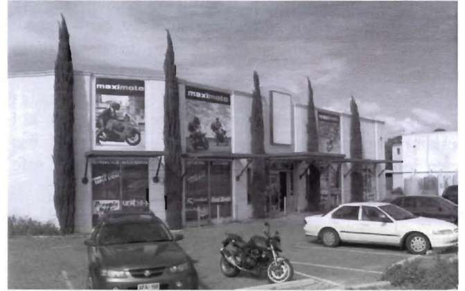
The new Maximoto Superstore

The staff at Maximoto have years of experience in the motorcycle industry and racing and have a vision for Maximoto to be Adelaide's best value motorcycle accessories store. With thousands of products the range is as good as it gets anywhere. The first thing that strikes you when you enter the store is the huge range of racing leathers, riding jackets and helmets ranging in price and style to suite most needs.