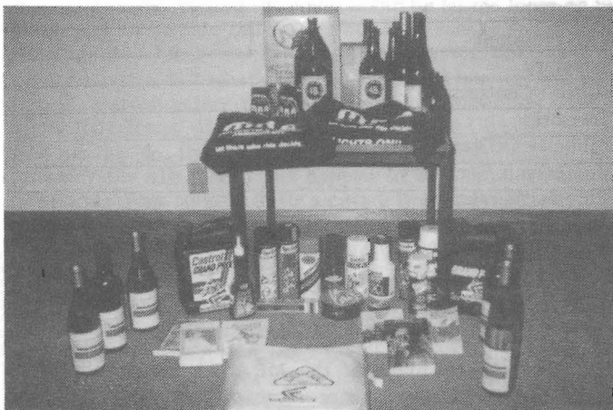
The Prize Pool