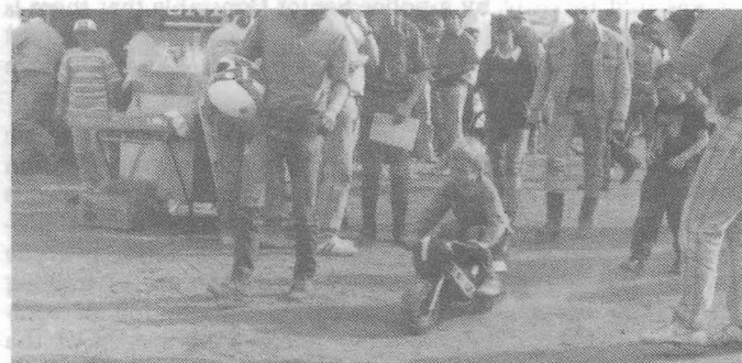
Move Over Wayne