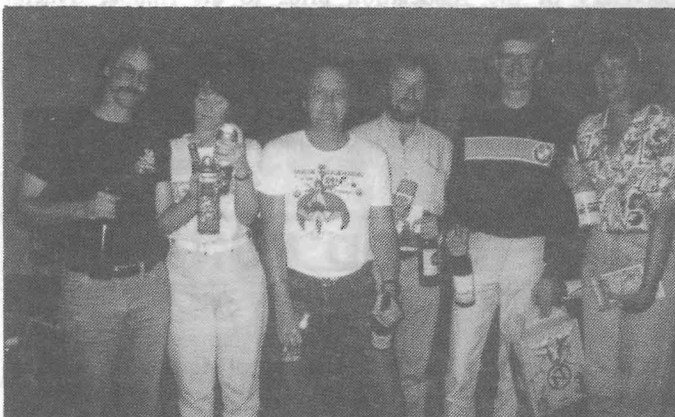
Winners: Team Duck Dodgers