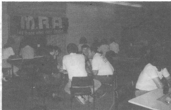
This Time We're going to win