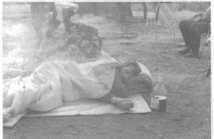
'Not A Pretty Sight' The Morning After

Non attendance compulsory, remember, if you don't have a badge, you can't prove you didn't go. All profits to M.S. Society. See the article elsewhere in the magazine.