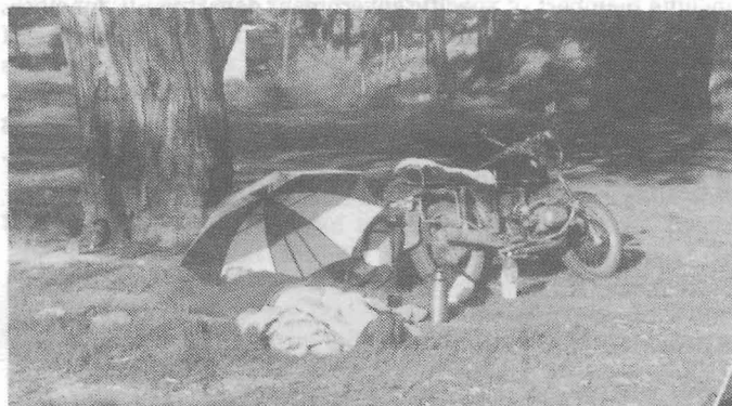
The Only Way To Go - Light