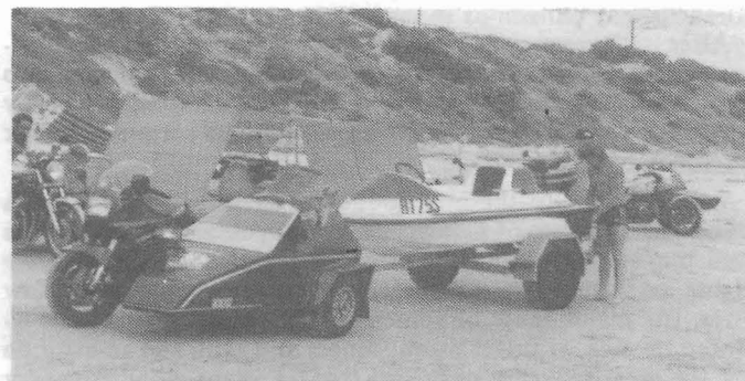
How Much Can A Bike Move?