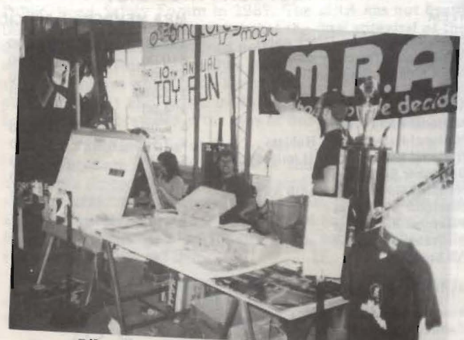
Bike Show Display 28th and 29th October