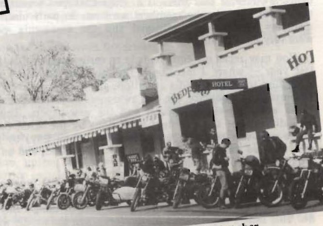
Fun Run to Woodside 15th October