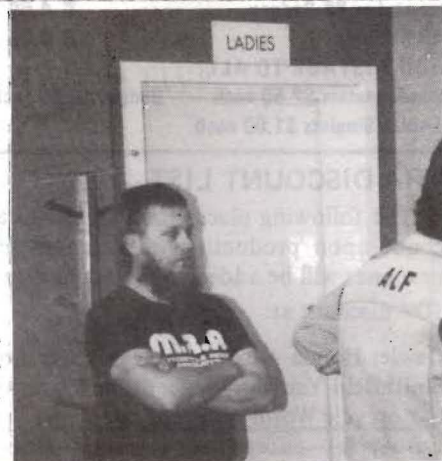
Guard duty over the Ladies Loo? Or has the MRA become non-sexist?