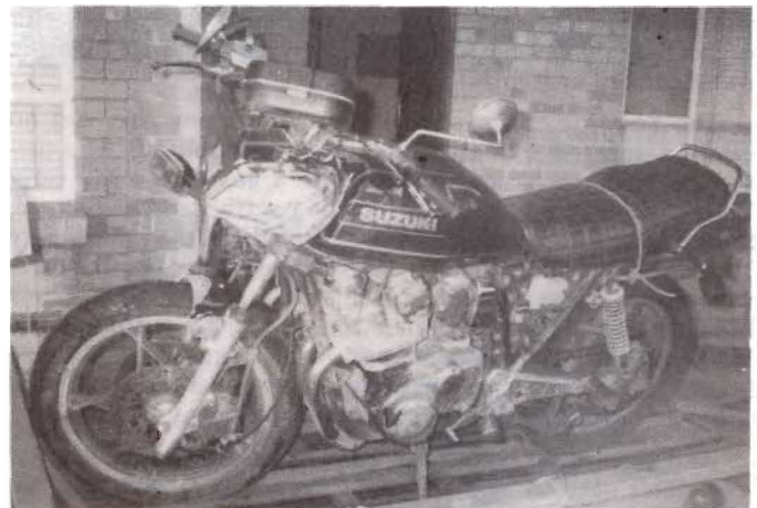
Ouch! Recovery Service Required