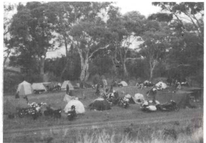
Tent City — home of the dedicated tourer!